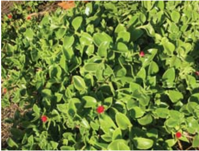
Aptenia, also known as red apple, is a firewise and drought-tolerant ground cover.