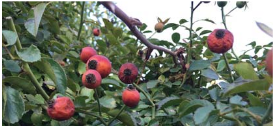
Rosehips can be harvested for teas rich in vitamin C.